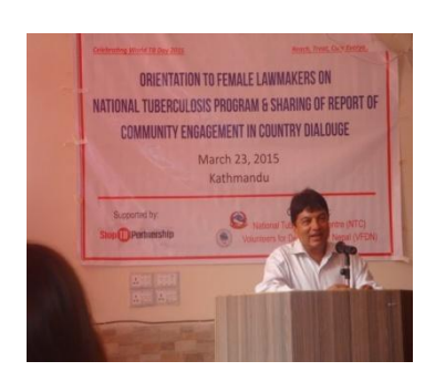
VFDN delivering Vote of Thanks

TB usually receives less attention than it deserves in the parliament and elsewhere all over the